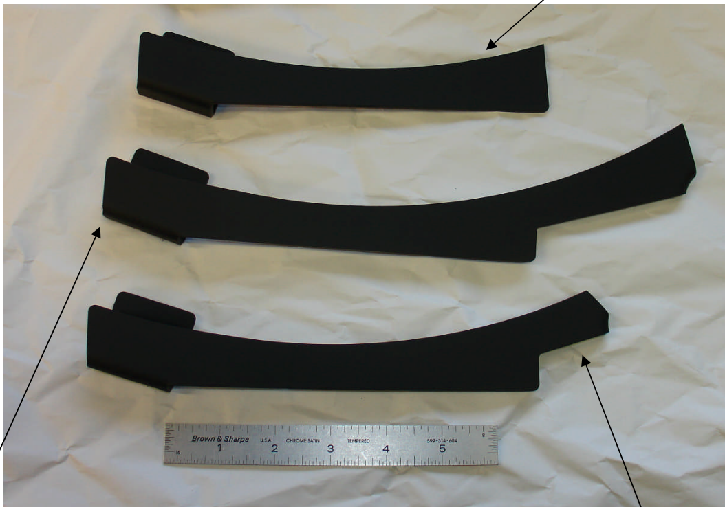
XX - Doubles Finger – March 2006